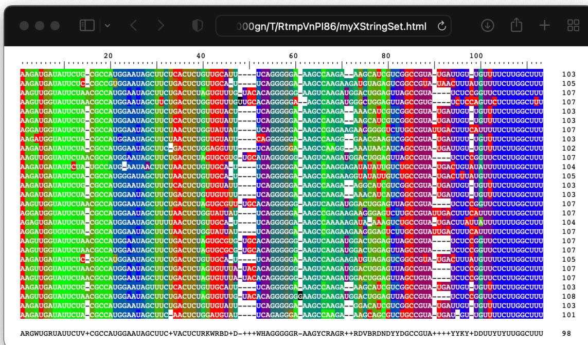
Figure 1: Predicted secondary structure of IhtA

In this color scheme, blue regions pair to green regions and red regions are unpaired. There is clear evidence for a hairpin loop near the 3'-end of IhtA, and weaker evidence for conserved secondary structure elsewhere in the sequences (Fig. 1).