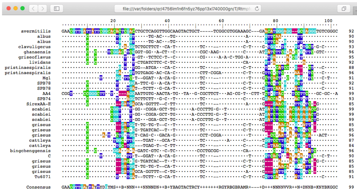
Figure 2: Amplicon with the target site for each primer colored

> names(amplicon) <- desc > # only show unique sequences > u_amplicon <- unique(amplicon) > names(u_amplicon) <- names(amplicon)[match(u_amplicon, amplicon)] > amplicon <- u_amplicon > # move the target group to the top > w <- which(names(amplicon)=="avermitilis") > amplicon <- c(amplicon[w], amplicon[-w])